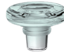
VINOLOK PHILOS FLINT & HALF FLINT