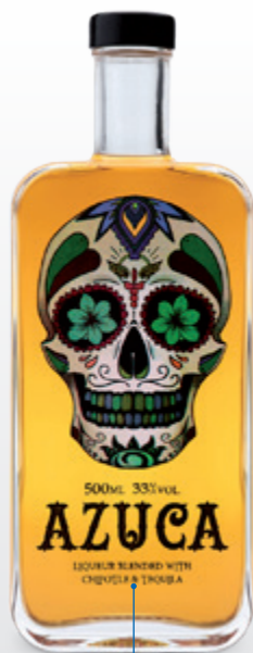
GARDI | 500 ML