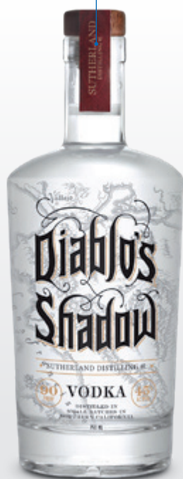
DECANTER ALEX | 750 ML