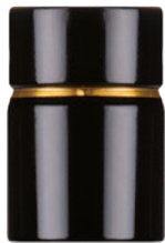
TOP GOLD/ SILVER/ BLACK & MORE COLOR