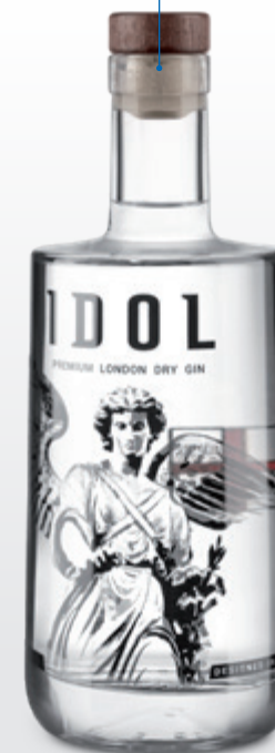
BELLAGIO | 700 ML

EN Berlin Packaging is a leading supplier of premium and specialty glass packaging for the spirits, wine, food, gourmet and home fragrances market. The company offers 3,000+ custom-designed products along with popular standard items . And with a world-class design team, a network of high-quality manufacturers, and a culture dedicated to service, we are ready to help you meet your exact needs. We will make your packaging unforgettable!