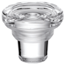
VINOLOK LOW TOP FLINT