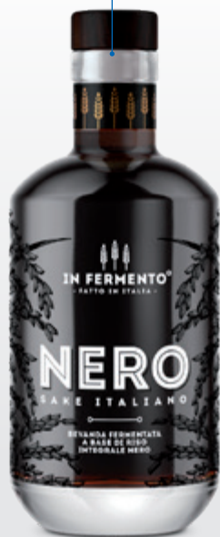
PACHO | 500 ML