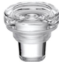
VINOLOK HIGH TOP FLINT