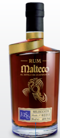
DECANTER 540 | 700 ML