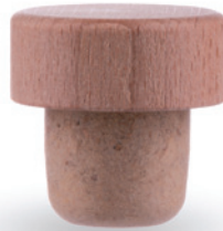
T-SHAPE, WOODEN HEAD, SYNTHETIC SHANK NATURAL