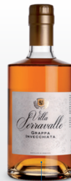
BELLEVILLE | 700 ML