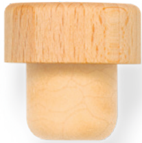
T-SHAPE, WOODEN HEAD, SYNTHETIC SHANK NATURAL

Closures can be customized with embossed logos, unique colors and even tailored shapes to create distinctive packaging solutions.