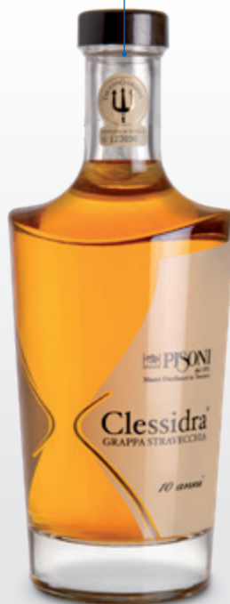
DECANTER LOLA | 700 ML