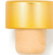
T-SHAPE, METAL HEAD, SYNTHETIC SHANK GOLD