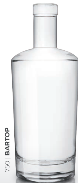
750 | BARTOP