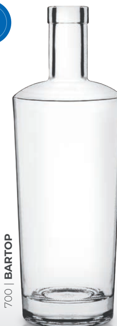
700 | BARTOP