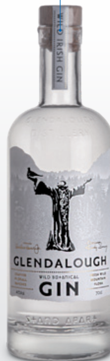
ASPECT | 700 ML