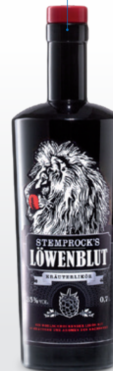
DECANTER ALEX SUPREME | 700 ML

FR Berlin Packaging est le leader mondial de l'emballage en verre haut de gamme sur le marché des bouteilles pour spiritueux, vins, pots alimentaires, gourmet et parfum d'intérieur. Qu'ils s'agisse de produits standards ou de produits aux designs personnalisés la société propose plus de 3.000 articles. Grâce à une équipe de design internationale, un réseau de producteurs de qualité premium et une culture dédiée au service client, nous sommes prêts à répondre à vos attentes spécifiques. Nous rendrons votre emballage inoubliable !