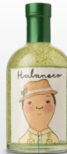
NOCTURNE | 500 ML