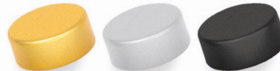
GPI DELUXE GOLD/ SILVER/ BLACK & MORE COLOR